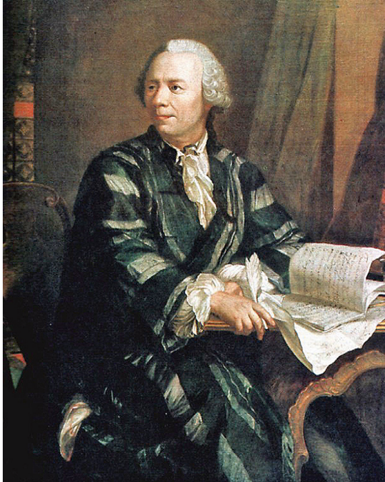
Fig. 1. Leonhard Euler (1707–1783) c. 1756.

Leonhard Euler hardly needs to be presented to anyone as everybody is well-acquainted with his – if not all then at least with the most important – scientific achievements.